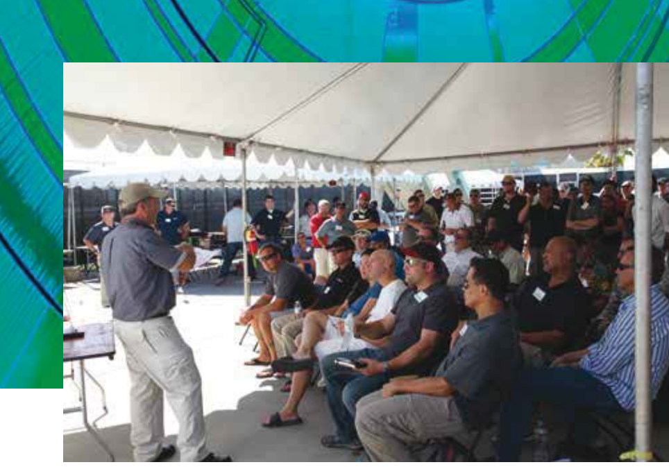
Above: Morning briefing on maritime diving equipment and how it will be used in operations.

Below: Ad hoc experiment with a Shark Marine-equipped diver on the move.