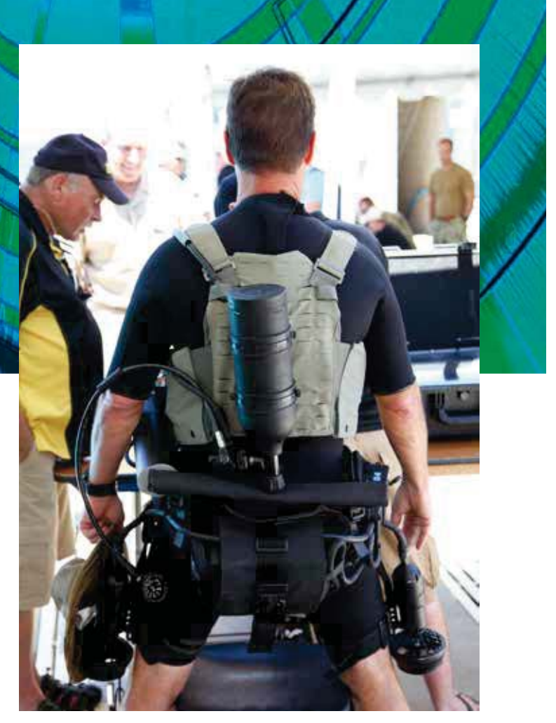
Patriot 3 Inc.'s Jet Boots and Shark Marine Technologies Inc.'s Subnet Diver to Diver to Surface Data Communications, and a diver ready for action.

Process: Themes and venues for TE events are developed annually and are based on input from USSOCOM Service Components and PEOs. The event process is initiated with a Request for Information (RFI) posted on Federal Business Opportunities (FBO.gov) approximately 4 months prior to the event. The RFI specifies the theme(s), technology areas of interest for the particular event, the submission format and other requirements. Technology developers respond